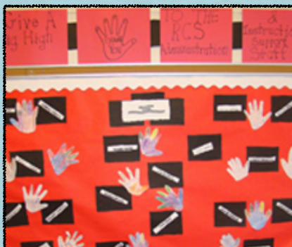
Students at Rogersville City School create a display that "gives a hand" to those being recognized.